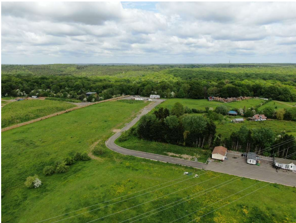
Photograph 2 – original site and link road