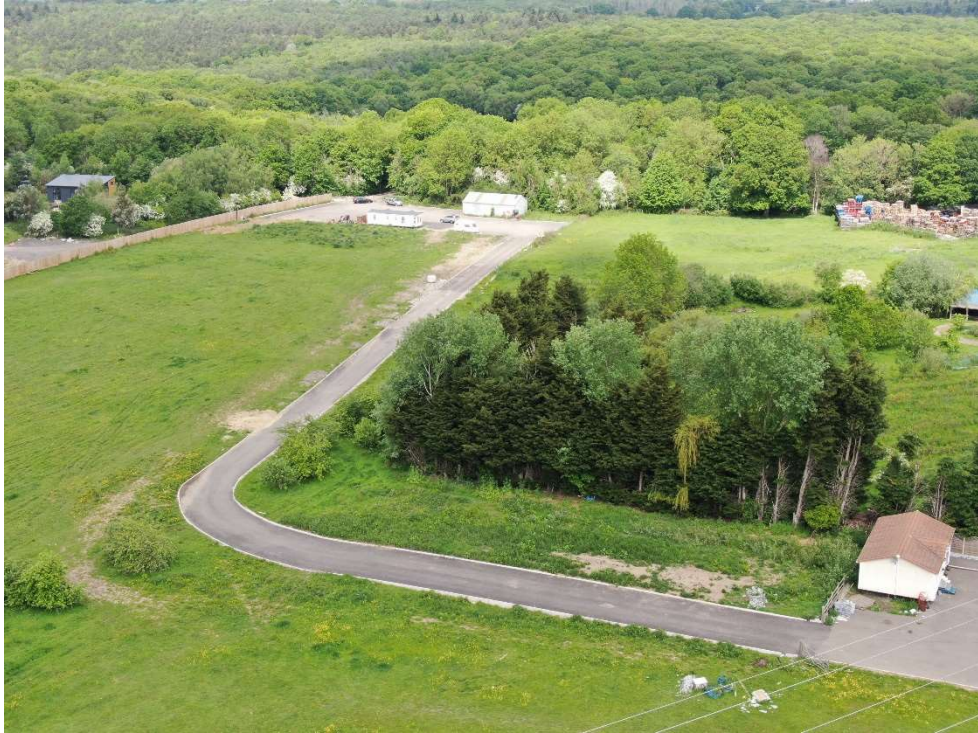
Photograph 3 – Link road to extended site