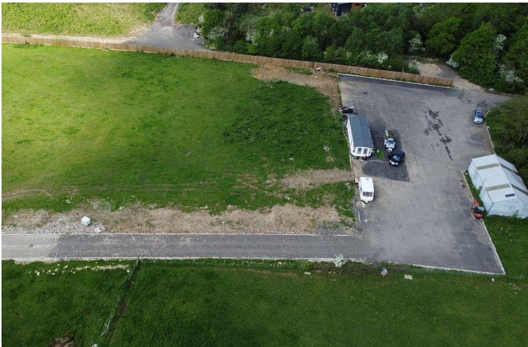
Photograph 4 – additional site