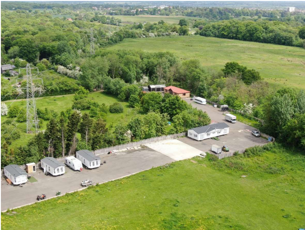
Photograph 1 – Site considered under application 07/23/0119/F