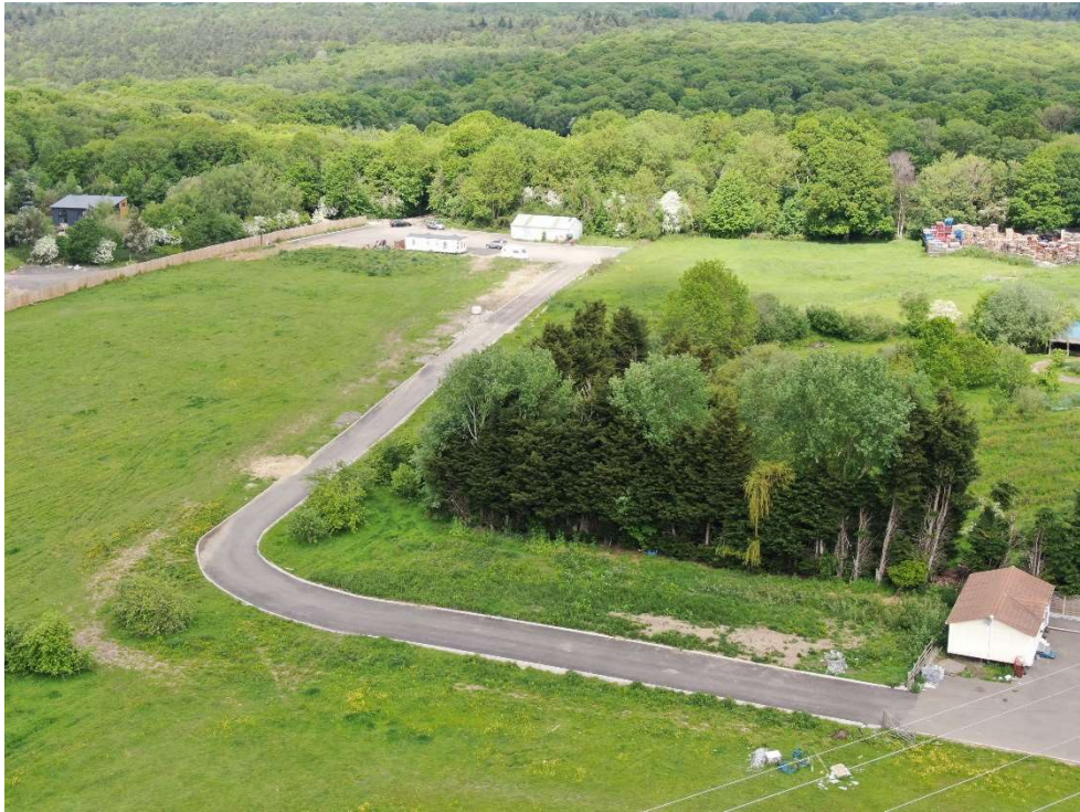
Photograph 3 – Link road to extended site