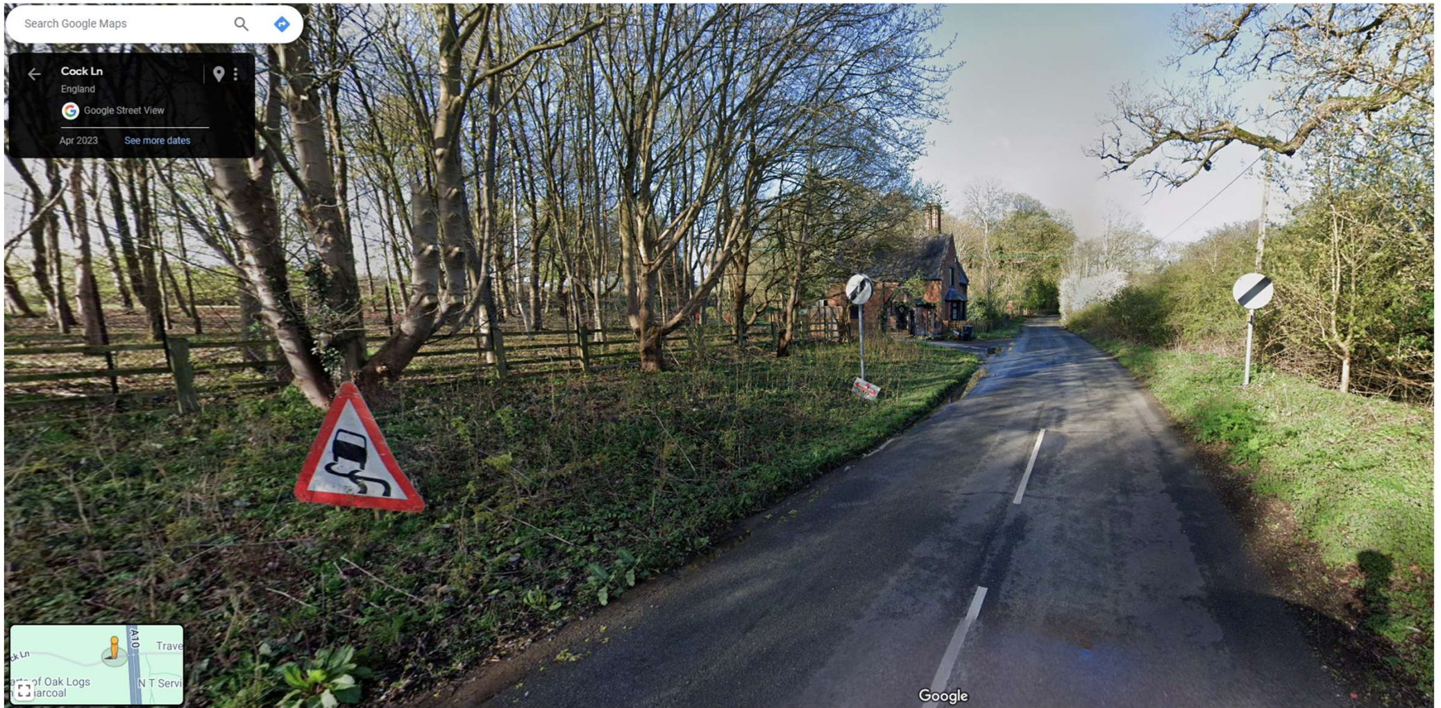
COCK LANE LOOKING WESTWARDS FROM JUST PAST A10 BRIDGE