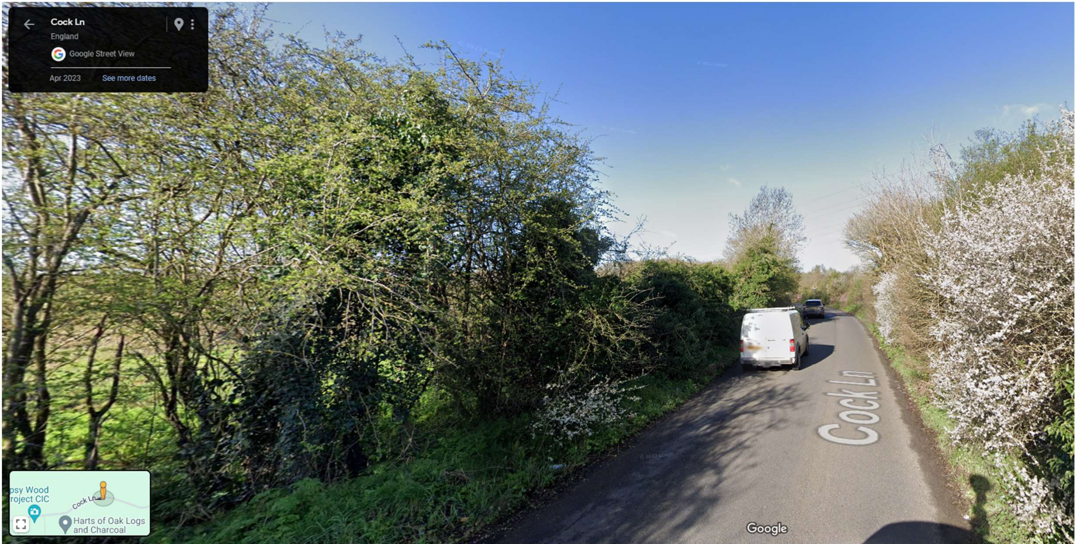
COCK LANE LOOKING WESTWARDS TRAVELLING TOWARDS SITE