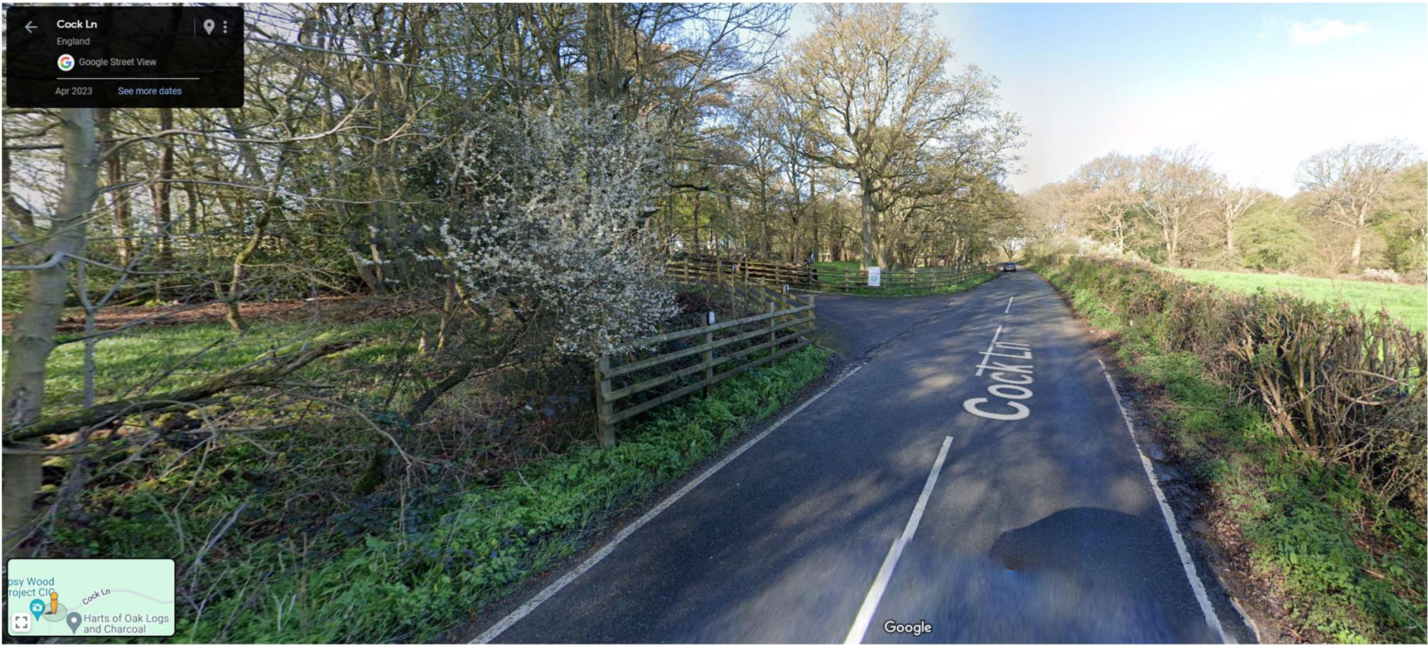
COCK LANE LOOKING WESTWARDS AT SITE ACCESS