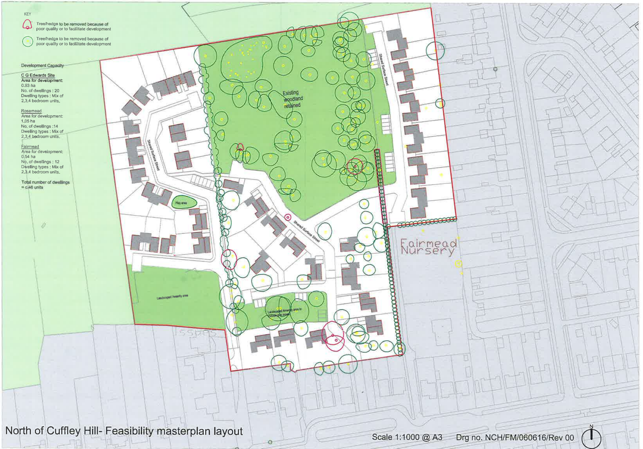
North of Cuffley Hill- Feasibility masterplan layout