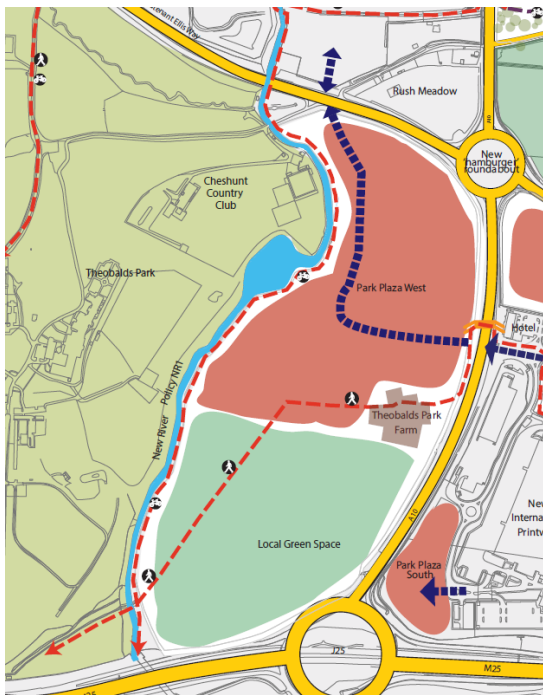
Submission Concept Plan