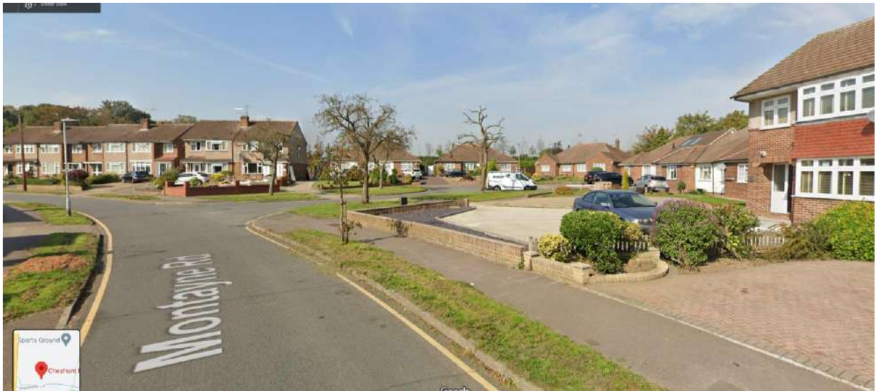
Figure 8: General local form looking west towards the development site