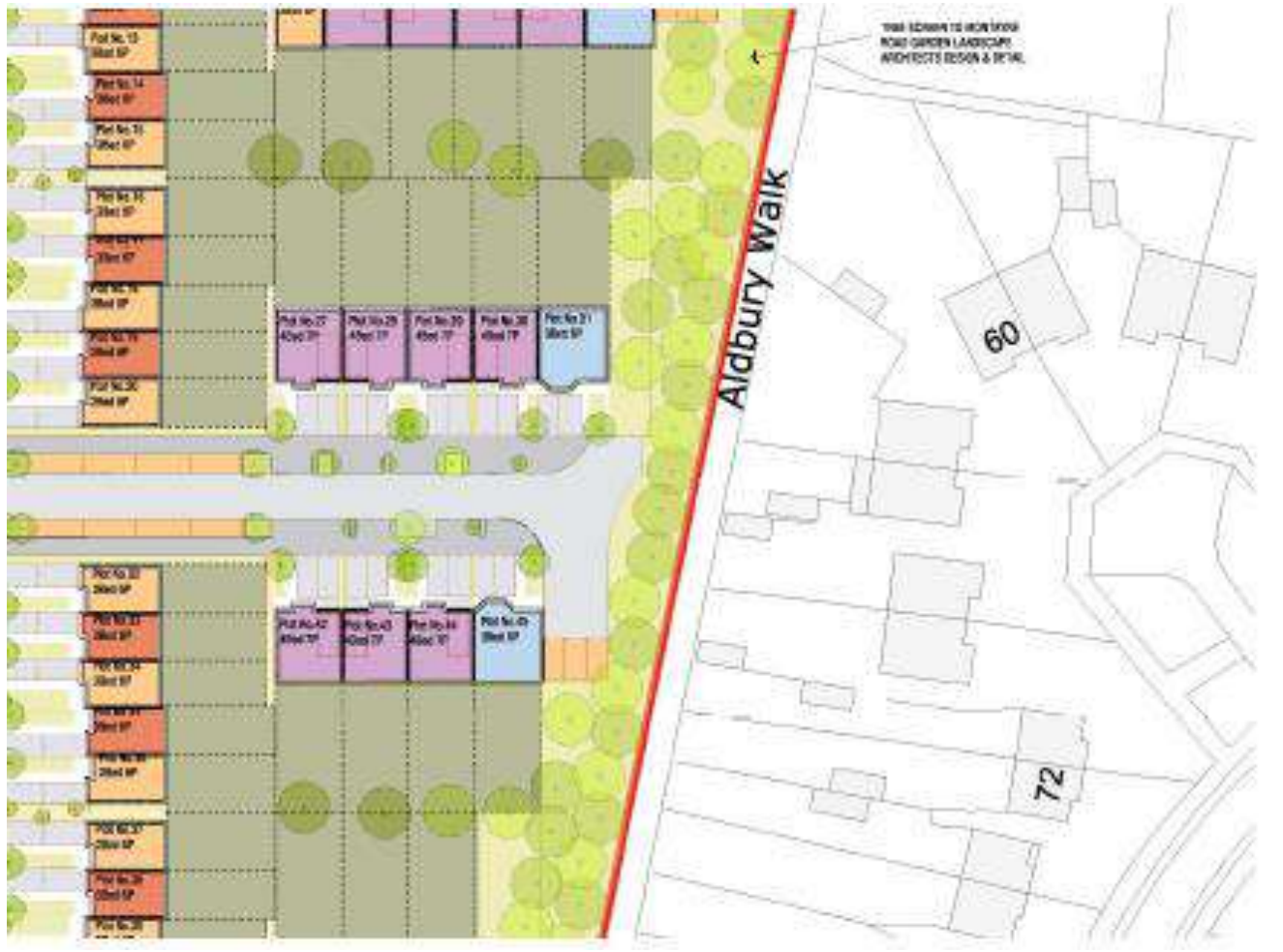
Figure 6: Extract of the proposed site plan illustrating the relationship of the terraces to the existing bungalows

8.18 As a result of insufficient separation and the scale of development, that includes flank windows and balconies, there is an unacceptable degree of overlooking to the existing properties. The result is an unacceptable erosion of privacy, actual and perceived in the rear garden environs and when using the rear facing rooms of dwellings particularly bungalows in Montayne Road. Recent Appeal decision APP/W1905/W/20/3265422 within the Borough considered new development at an increased height to that which presently exists and the associated impact of window openings on the amenities of neighbours. The Inspector concluded that even were a window to be obscure glazed, movement would be perceptible within the property, when open noise would be audible and the height of the position for overlooking would allow for views into the rear elevation windows of the neighbouring properties. Such views were frequent as the occupiers go about their everyday activities and the erosion of neighbouring privacy