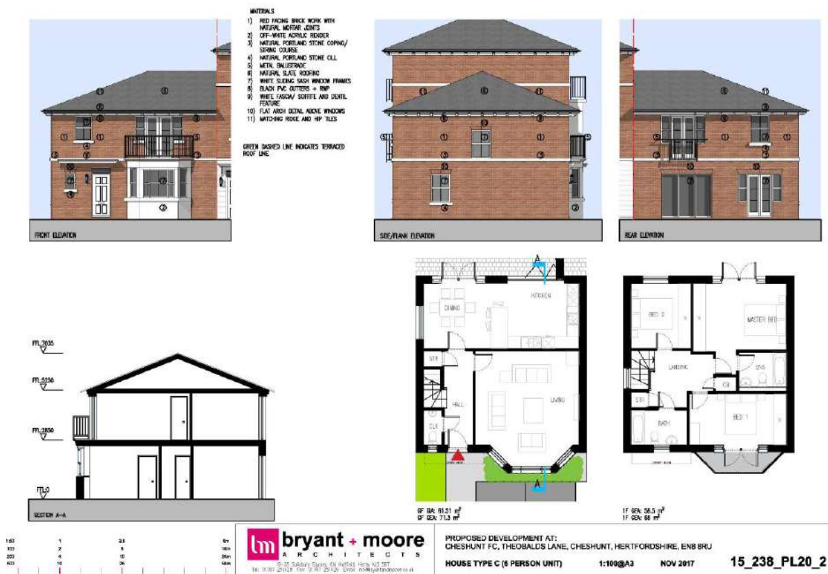
Figure 5: Plans and elevations of the block visible from 62 Montayne Road at the closest point of 31m.