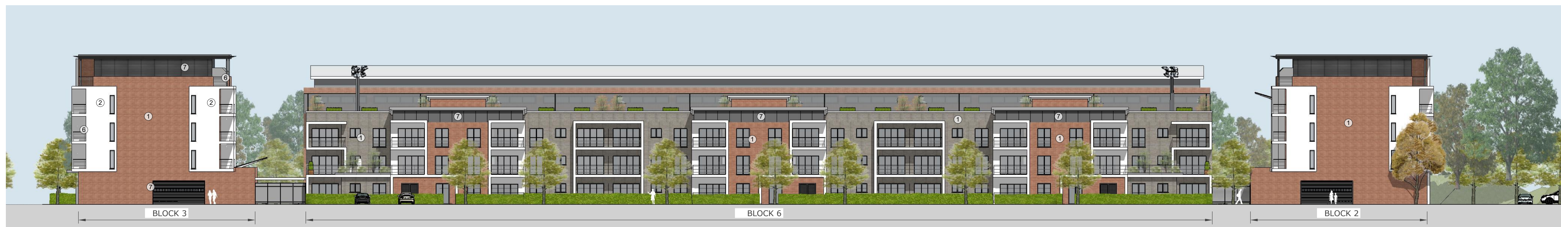
D - East Elevation