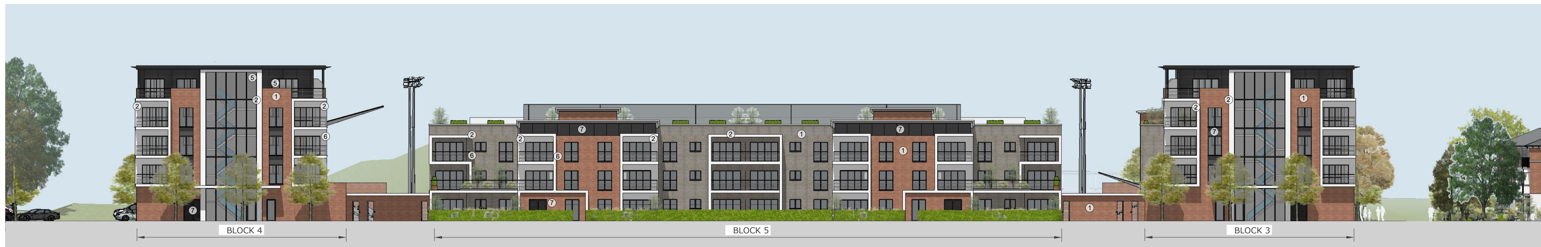
A - South Elevation