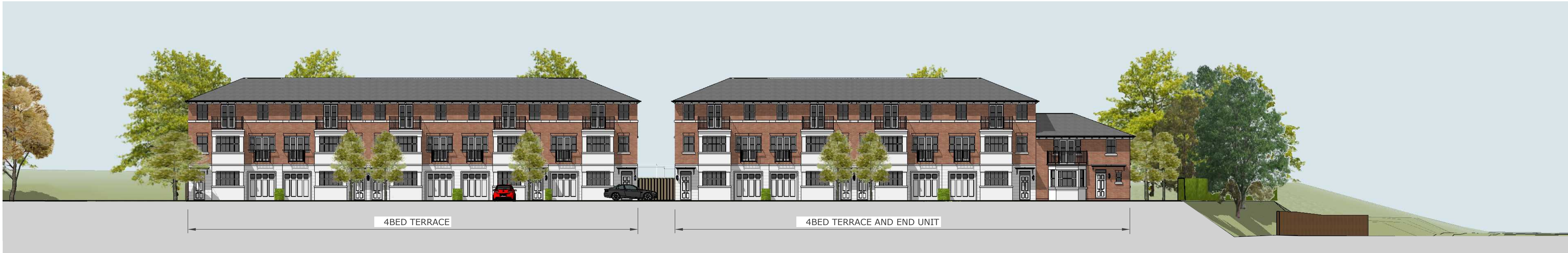
B - Elevation