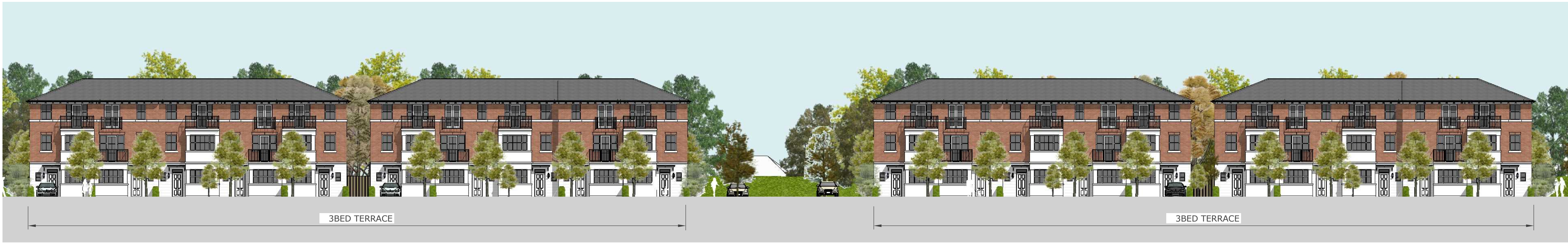
A - Elevation