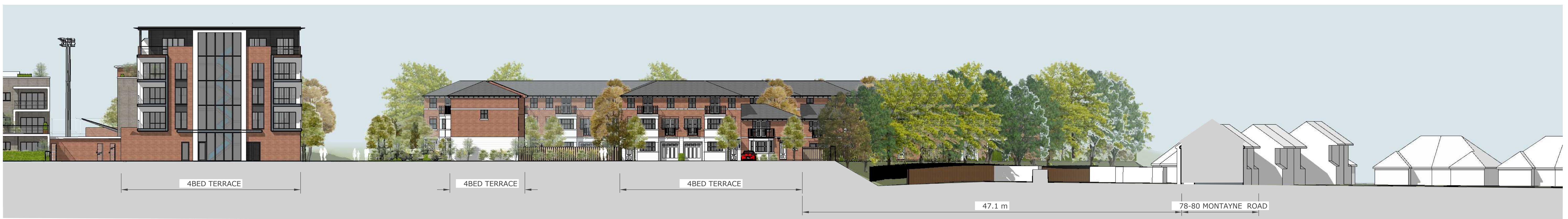
D - Elevation