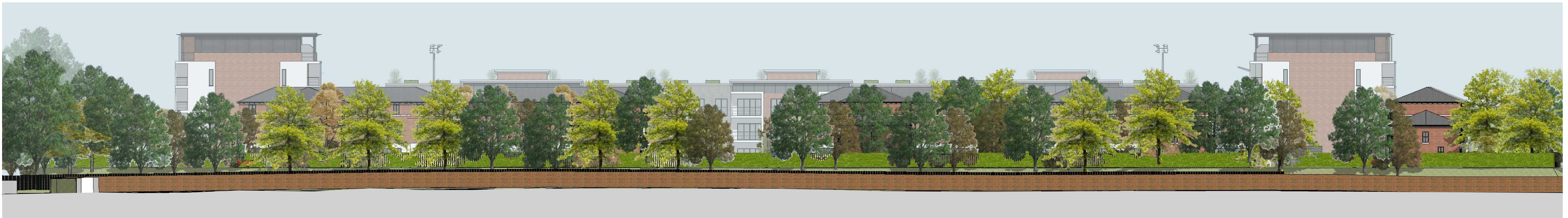
C - Elevation